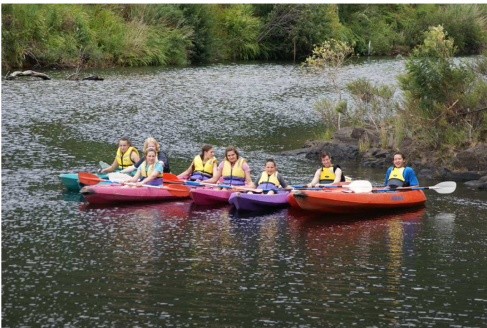
Rafting up with the kayaks