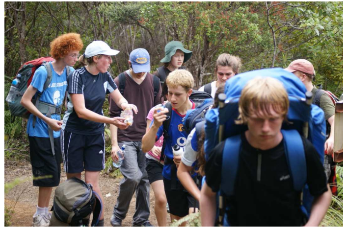
Pitstop for Marshmallows