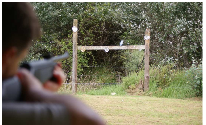
Target practice with the airguns