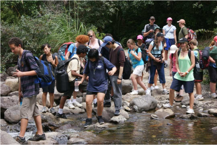
Fording the Kauaeranga River