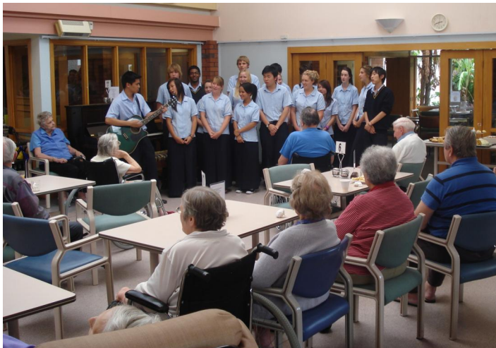
The students singing to the residents

This afternoon, the Year 13 students visited the Everill Orr Village as part of their community service activity. Some girls from the class baked muffins, some baked scones with fresh cream and jam, some made fudge and also cakes. They served their baking with juice whilst serenading them with the violin, piano and the guitar. They also mixed and chatted with the residents, bringing a smile to some faces. They thoroughly enjoyed the afternoon and are grateful for the experience. They were a testimony to God's love and grace.