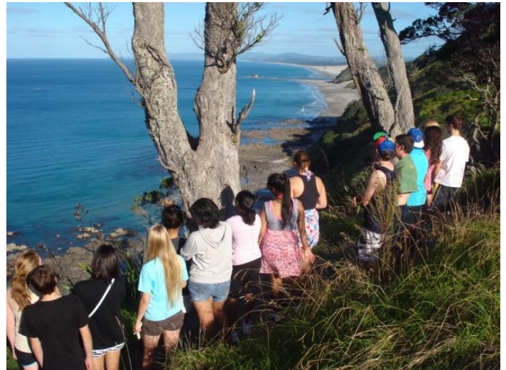
A walk along the Mangawhai Heads cliff tops

The staff and parents helpers are all very impressed with this group of 21 teenagers and we are all sure they will be a shining example during their 3 week overseas trip, outstanding representatives of their families, their Christian school, the nation of New Zealand and the Lord Almighty!